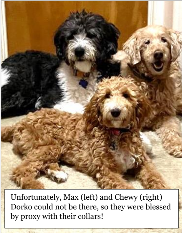
Unfortunately, Max (left) and Chewy (right) Dorko could not be there, so they were blessed by proxy with their collars!