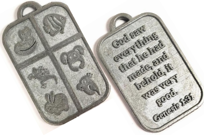
Each pet owner received a prayer card and the pets each received a tag for their collar.