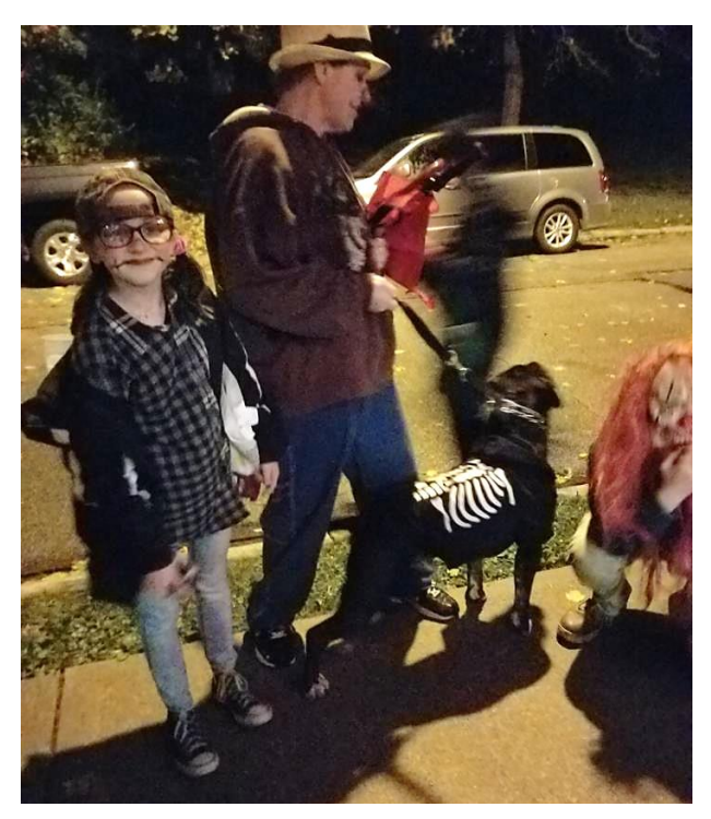
Last year, Trick-or-Treaters received a bag of treats along the Pumpkin Parable and some information about Trinity.