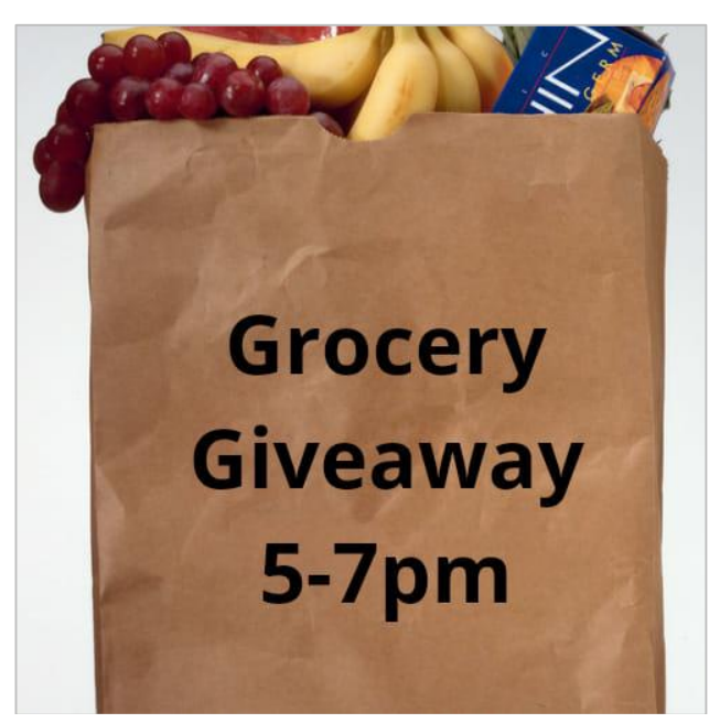
This advertisement for the food giveaway was taken from Christian Life Church's Facebook page.