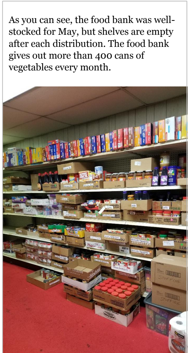
As you can see, the food bank was well-stocked for May, but shelves are empty after each distribution. The food bank gives out more than 400 cans of vegetables every month.