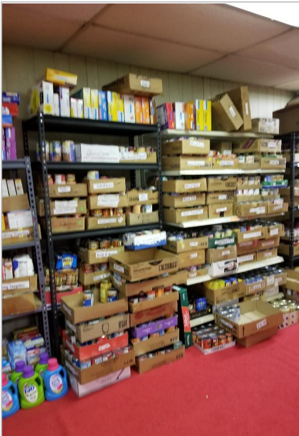
After Trinity shoppers delivered the food they had purchased Beverly helped Mrs. Capets unpack and store it on the shelves along with items donated to and/or purchased for the food bank.

No one in our community should go hungry when we have the resources to help. Praise God from whom all blessing flow!