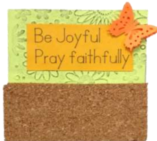
This is just one of the many prayer boards that will be available to the congregation in July.