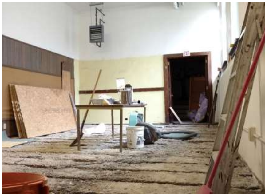
The floor in the former pre-school room has been torn up and the room is being prepped for the new floor.

More news on the church roof project will be made available in November. A new Men's Project Group is in the works; more details will be available in October. Our next regular trustees meeting will be November 15 at 6:30 p.m. If you are interested in becoming a trustee, or if you are interested in any of the upcoming projects, please let me know. Thank you.