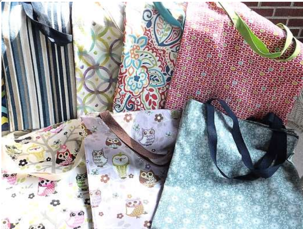
These are just some of the tote bags sewn by the ladies of Trinity UMC over the past winter. The goal is to fill each bag with the items in a school kit.

We will collect the items and fill the totes from July through mid-August. A place near the library will be set up for you to drop off your filled tote bags and other items.