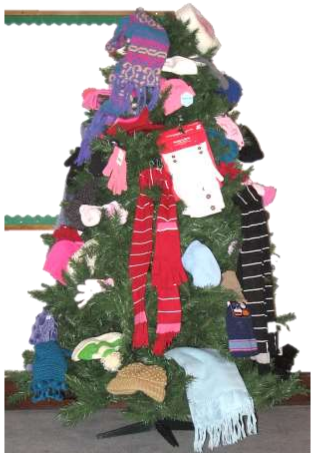
The giving tree overflows with contributions from the 2010 hats and gloves drive.

Don't forget, Trinity gets a 10% discount coupon from Burlington Coat Factory for each coat donated. Coupons are on the table in the vestibule for your use.