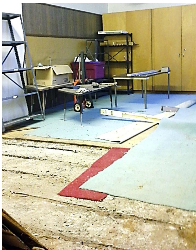
Demolition of the unsafe floor in the former preschool room is underway.

After the sanctuary is painted, we will have the carpeting cleaned. Because of this, church services on October 18 will be held in the social room (a change of scenery!). We then will need help retuning the pews to the sanctuary the evenings of October 19 and 20. The October 20 Trustees Meeting will be a work party and will