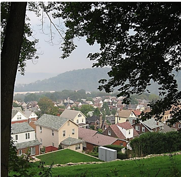
How do you view Trafford? A view of the borough from Inwood Road.