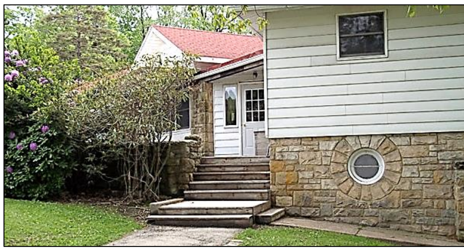
Martha Cabin, our favorite cabin, accommodates up to 16 people.

Ladies, you are invited to join us for a wonderful weekend in a cozy cabin on the magnificent mountaintop at Jumonville! Jumonville is a Christian Camp and Retreat Center in Hopwood above Connellsville, PA. Our first retreat was in 2006 and it has been an annual event that we've enjoyed every year since then!