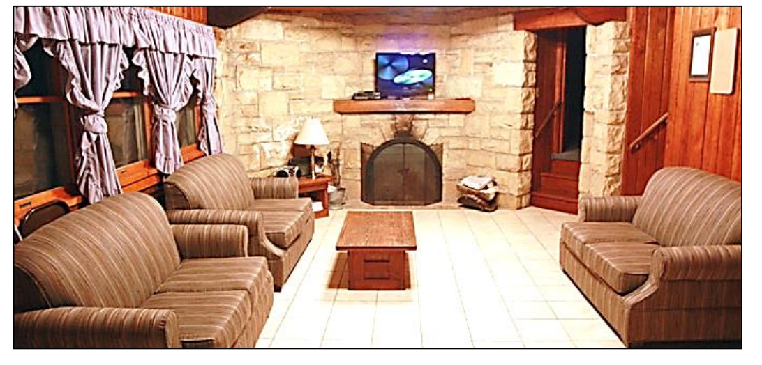
Inside, Martha Cabin features comfortable furniture and a cozy fireplace to keep us warm on those chilly evenings.

We fix our own breakfast (oatmeal, muffins and eggs) lunch and dinner (homemade soup) in our