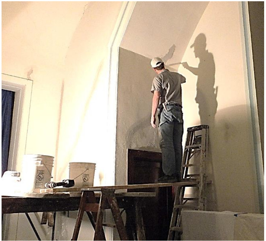
Plasterers needed ladders and scaffolding to reach all of the places needing repair.