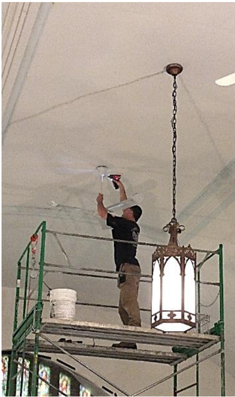
The electrician removed the old ceiling fans...