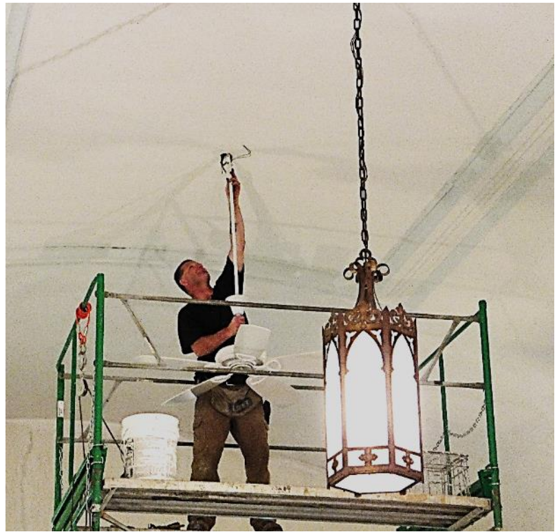
...and installed new, remote controlled fans. In the winter, the new fans will be used to push warm air back down to better heat the sanctuary.