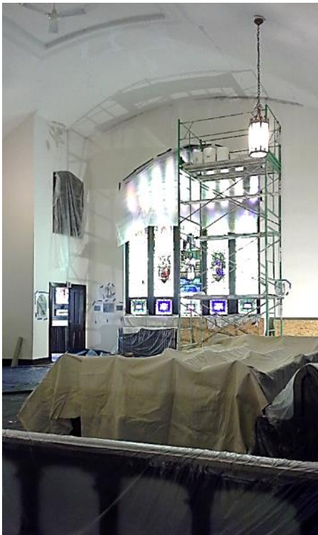
Scaffolding is set up and work is ready to begin in the sanctuary.