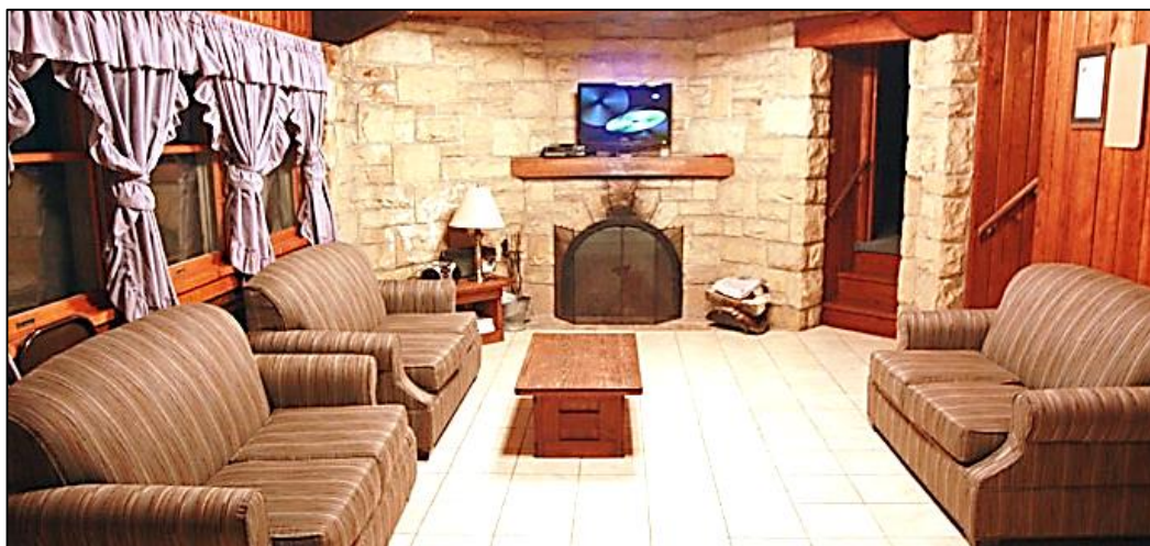
Inside, Martha Cabin features comfortable furniture and a cozy fireplace to keep us warm on those chilly evenings.

You are welcome to join us! Please come!