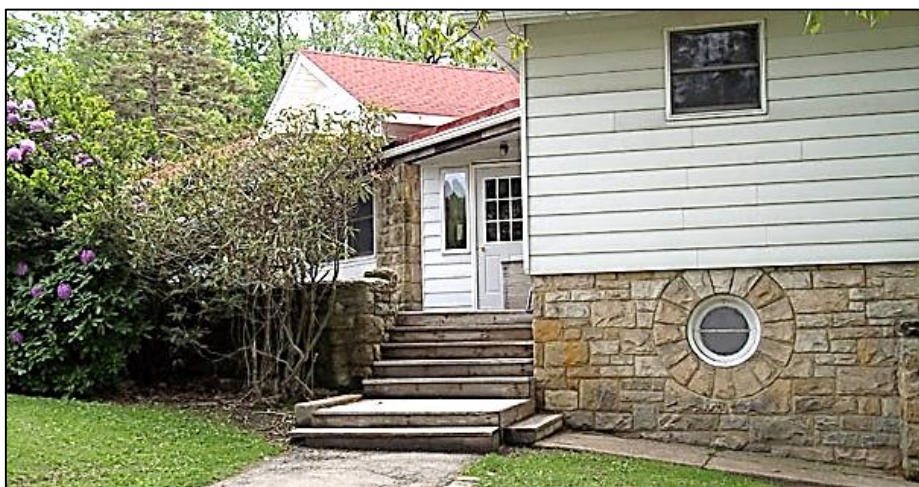
Martha Cabin, our favorite cabin, accommodates up to 16 people.

Ladies, you are invited to join us for a wonderful weekend in a cozy cabin on the magnificent mountaintop at Jumonville! Jumonville is a Christian Camp and Retreat Center in Hopwood above Connellsville, PA. Our first retreat was in 2006 and it has been an annual event that we've enjoyed every year since then!