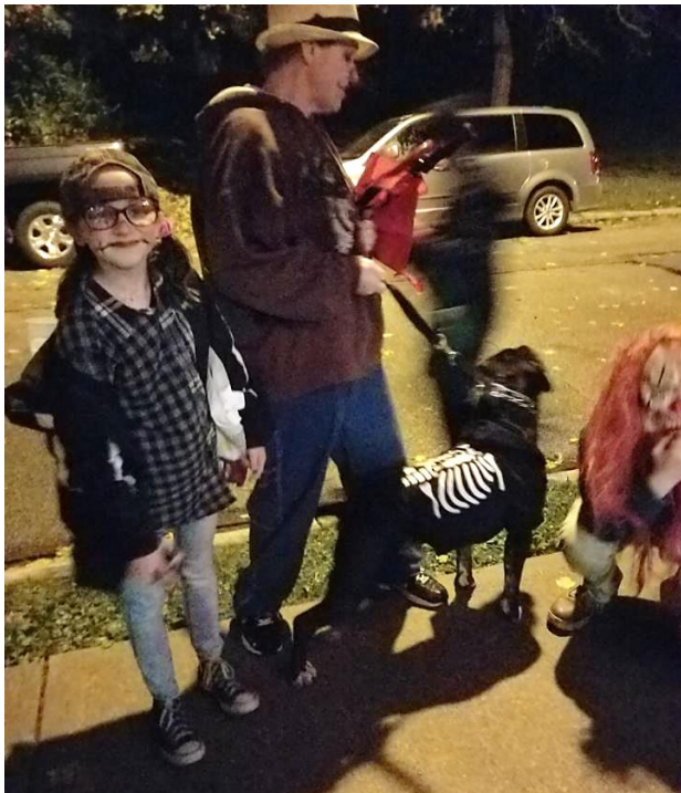
Last year, Trick-or-Treaters received a bag of treats along the Pumpkin Parable and some information about Trinity.