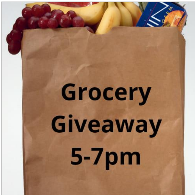
This advertisement for the food giveaway was taken from Christian Life Church's Facebook page.